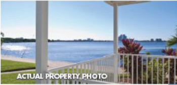
ACTUAL PROPERTY PHOTO