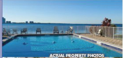
ACTUAL PROPERTY PHOTOS